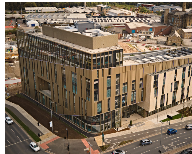
The Daphne Steele Building at the National Health Innovation Campus in Huddersfield

With unparalleled connectivity to Leeds and Manchester and scope for long-term investment growth, Huddersfield offers investors and occupiers the opportunity to achieve strong commercial returns while contributing to long-term place-making.